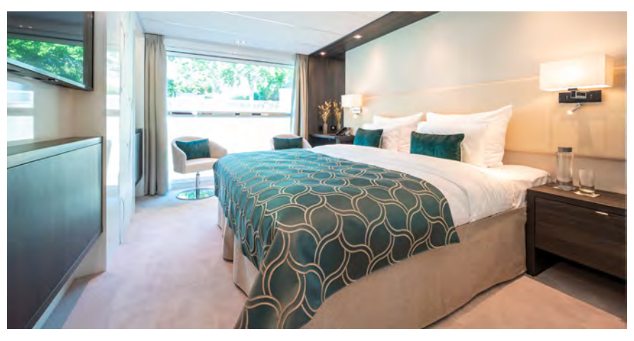
Stateroom onboard an AMADEUS vessel similar to the NEW AMADEUS Riva