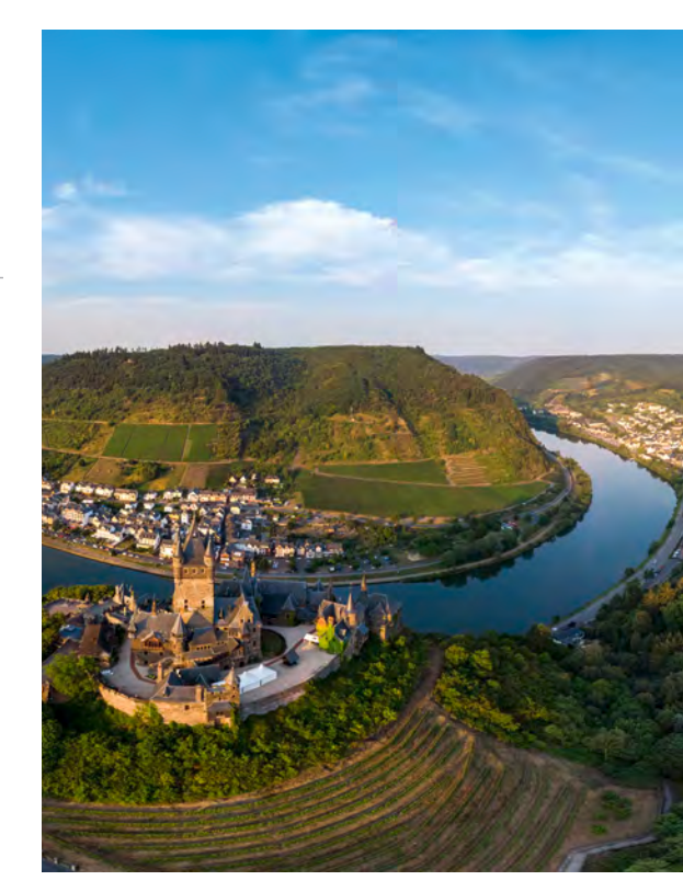
Cochem on the Moselle